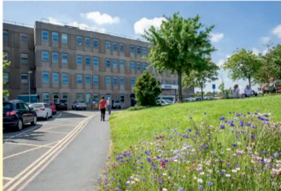
Shrewsbury & Telford

Upcoming Interviews for the month of May & June 2021