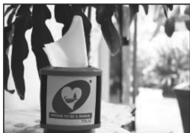
Revolving Pen Holder (Plastic) Rs. 130/-