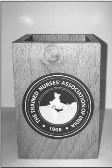
Pen Stand (Wooden) Rs. 130/-