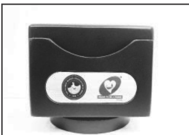
Revolving Pen Holder Standard Classic Rs. 390/-