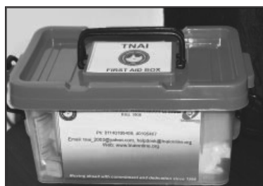
First Aid Container With medicine Rs. 750/- Without medicine Rs. 390/-