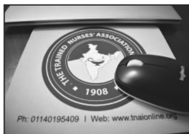
Mouse Pad Rs. 65/-