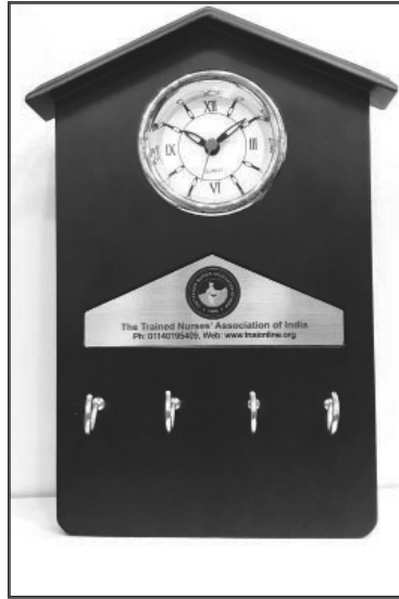
Wall Clock with Hanger Rs. 300/-