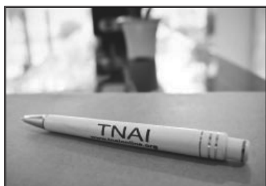
Pen Rs. 10/-