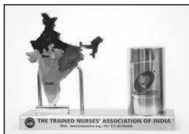
Pen Stand (Metallic with India Map) Rs. 350/-