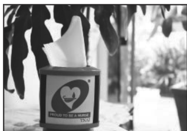
Revolving Pen Holder (Plastic) Rs. 130/-