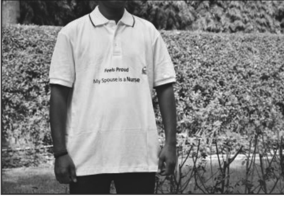
T-Shirt Collared Rs. 350/- Round Neck Rs. 240/-