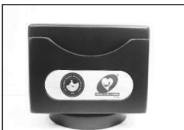
Revolving Pen Holder Standard Classic Rs. 390/-