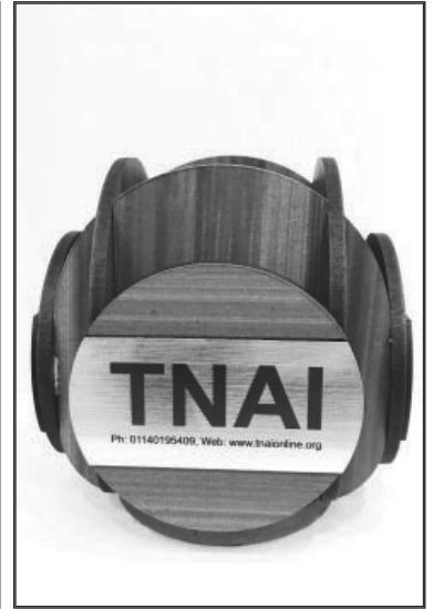
Revolving Pen Holder (With Pen) Rs. 270/-