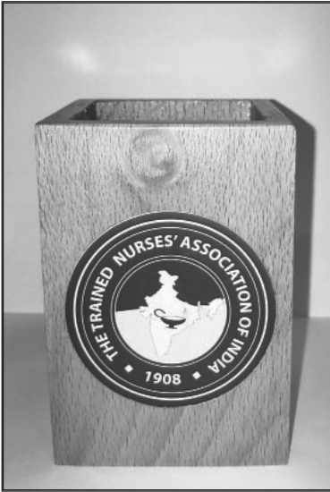
Pen Stand (Wooden) Rs. 130/-