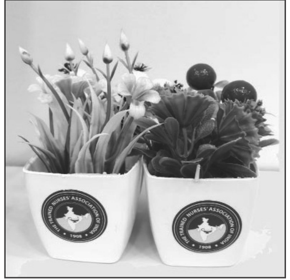
Flower Pot Rs. 25/-