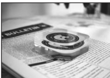
Paper Weight Rs. 80/-