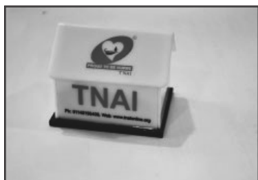
Paper Weight Rs. 50/-