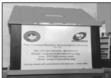
Money Bank Rs. 150/-