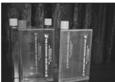
Water Bottle - A5 size Rs. 250/-