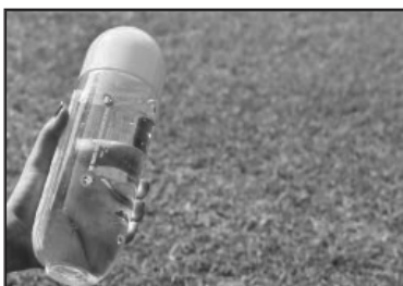
Medicine Pill Water Bottle Rs. 240/-