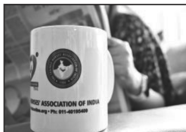
Mug Rs. 110/-