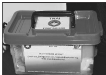
First Aid Container With medicine Rs. 750/- Without medicine Rs. 390/-