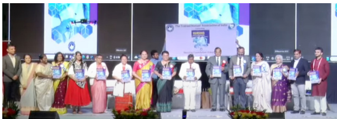
Release of TNAI's Publication on 'Nursing Foundation Volume 2'.