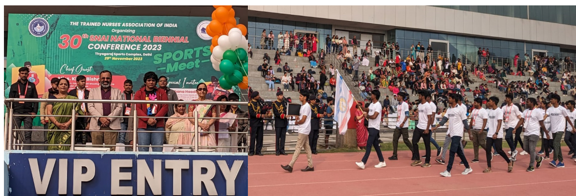
Parade by the nursing students from various parts of India.