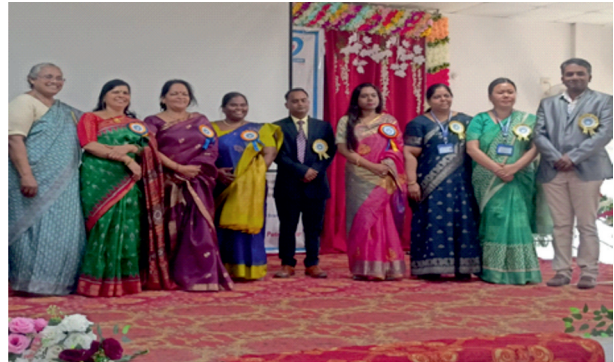
EC members along with the National officials