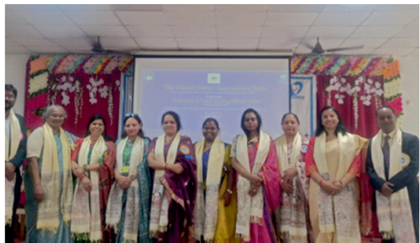
Panelists along with National officials