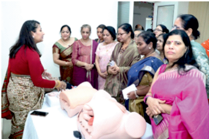
National Executives visiting the Simulation center.