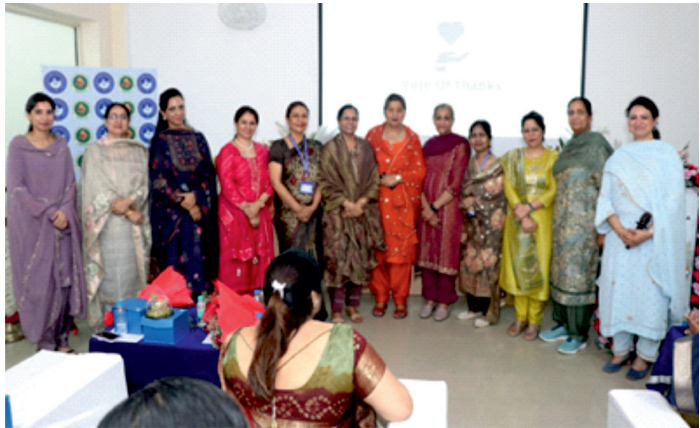
TNAI Punjab State Branch Executives