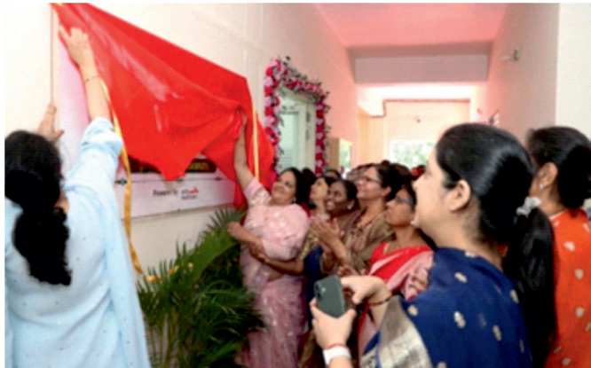
Inauguration of Skill Lab