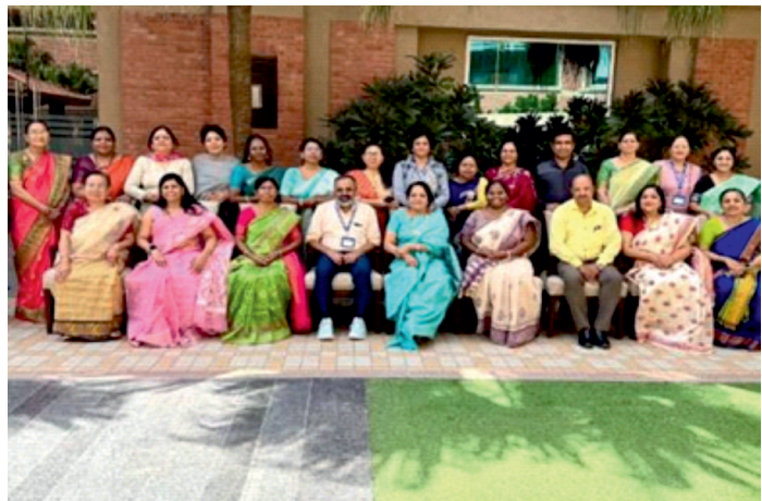
TNAI National Executive members